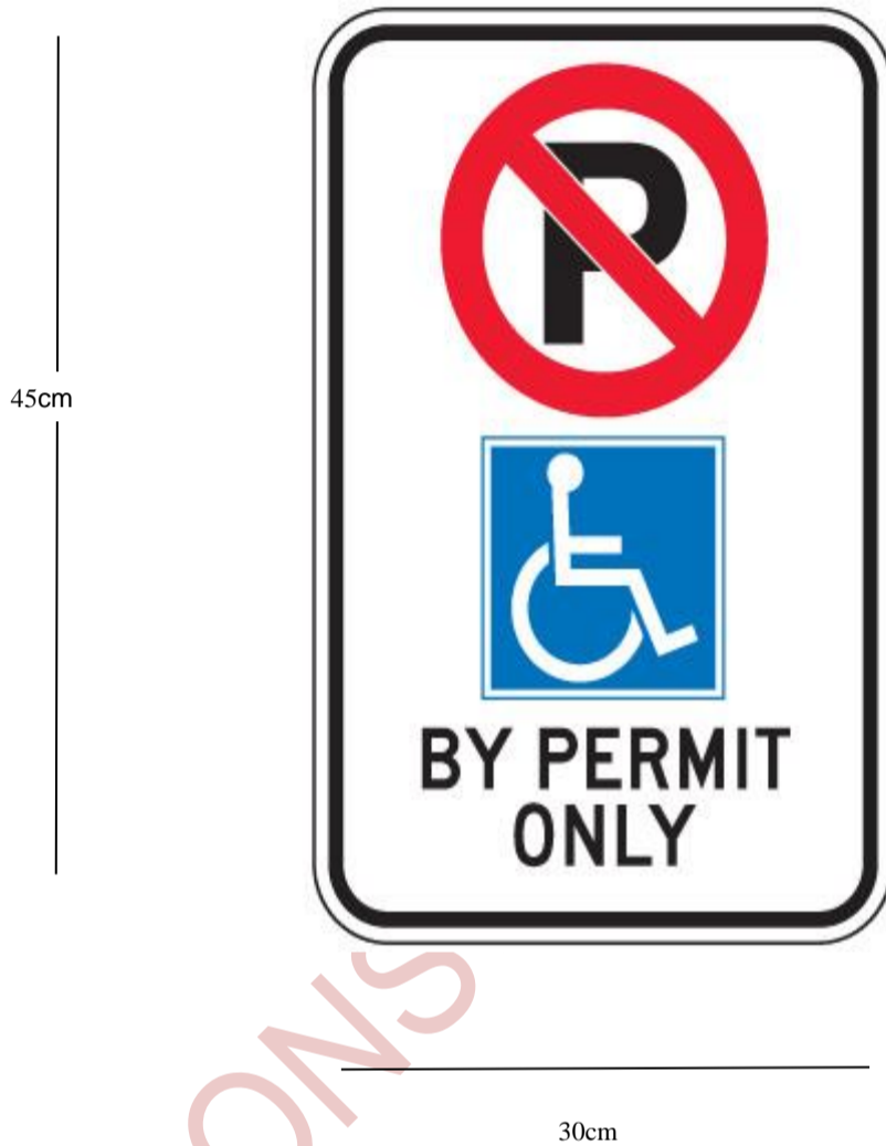
FIGURE 1 OFFICIAL SIGN