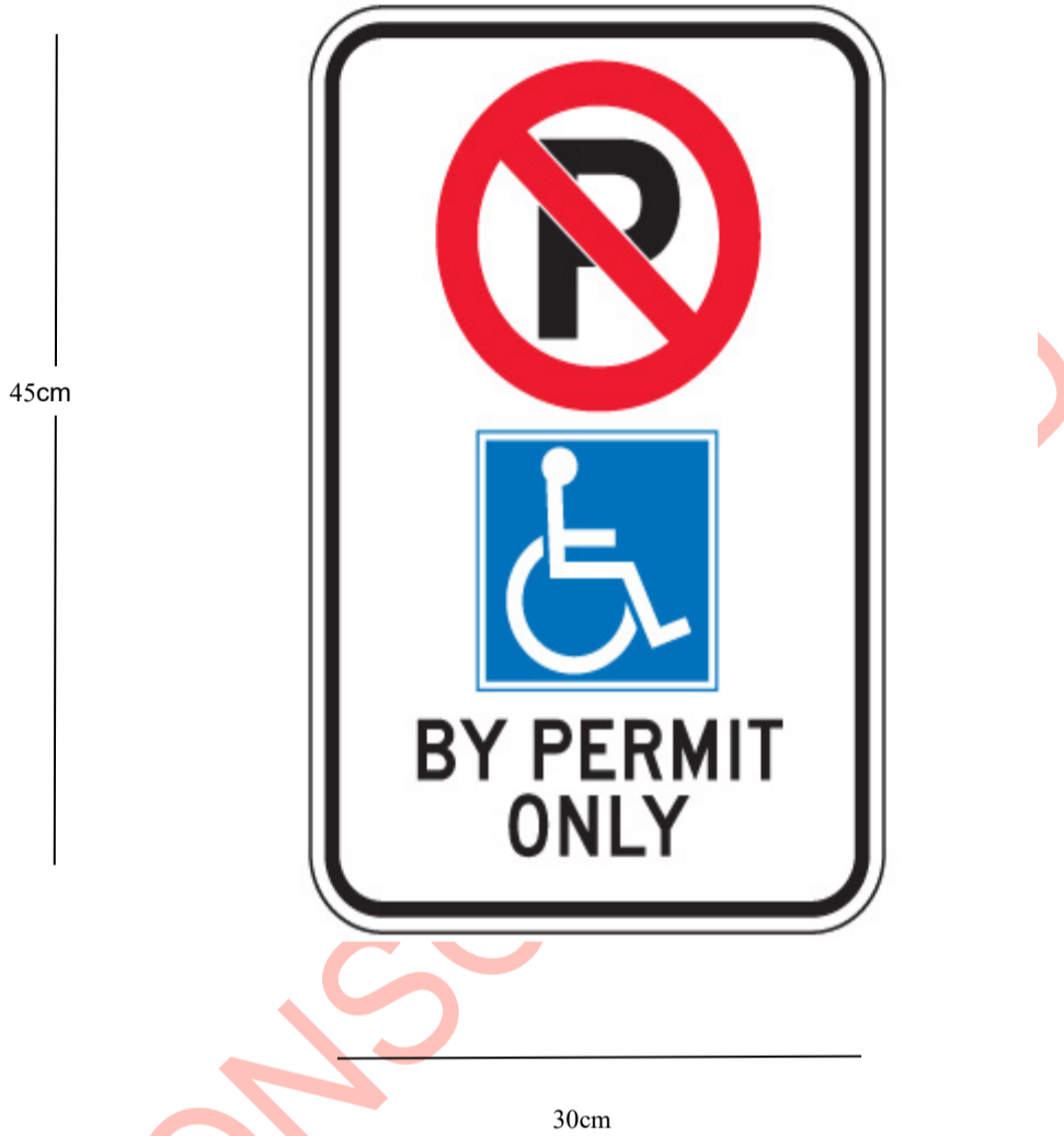
FIGURE 1 OFFICIAL SIGN