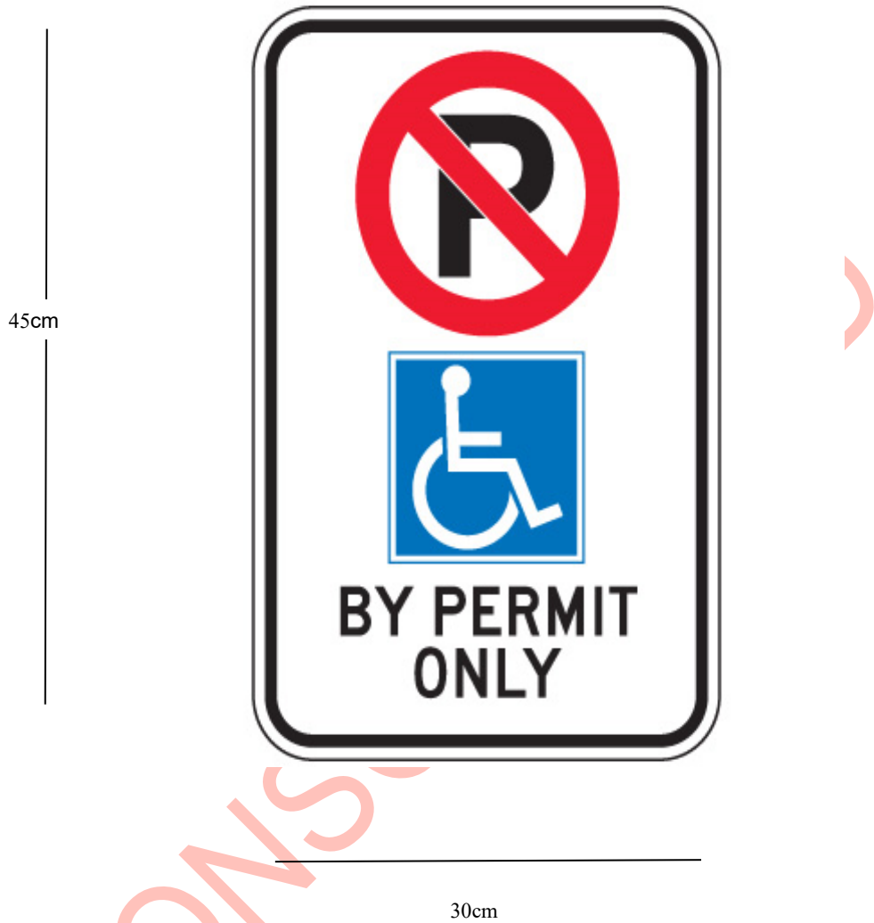
FIGURE 1 OFFICIAL SIGN